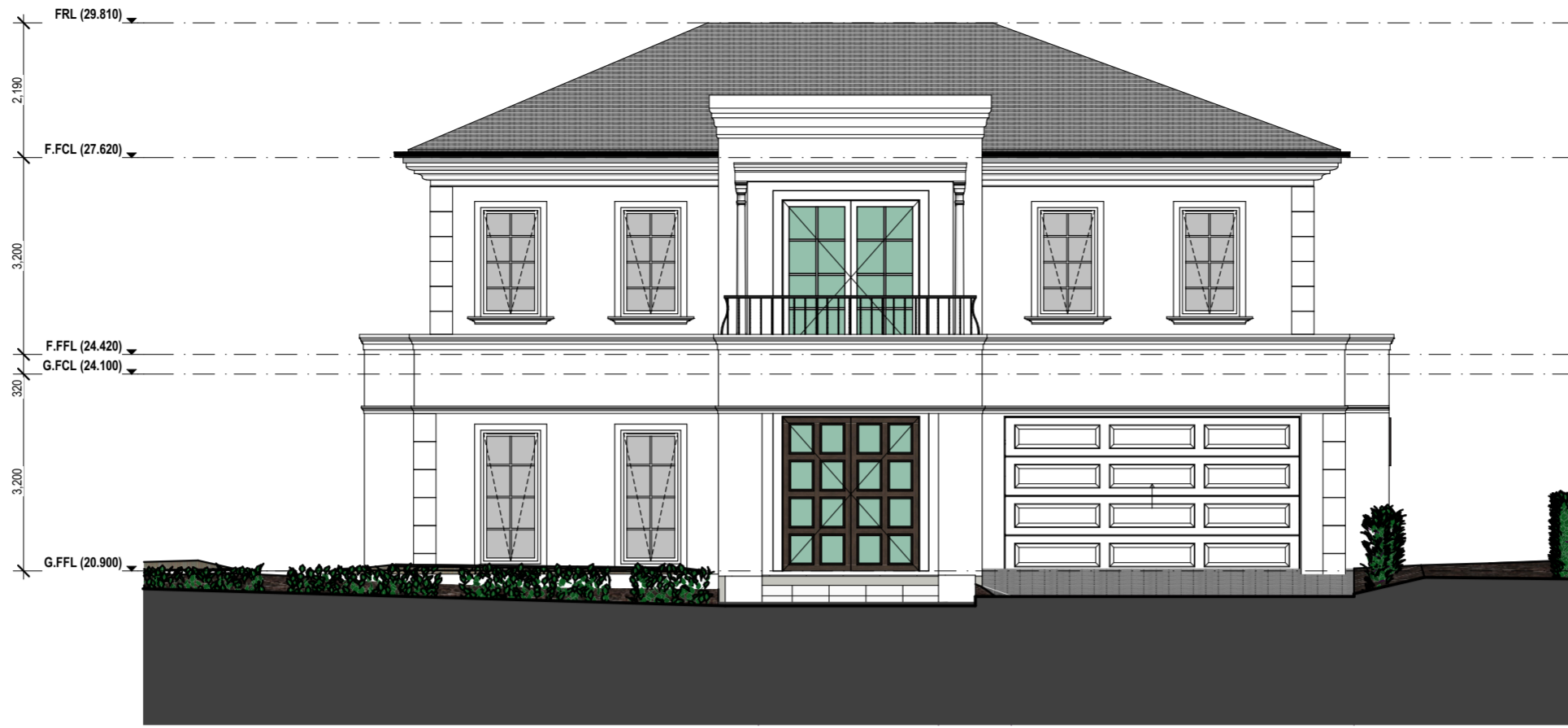
○ FRONT ELEVATION 1:100