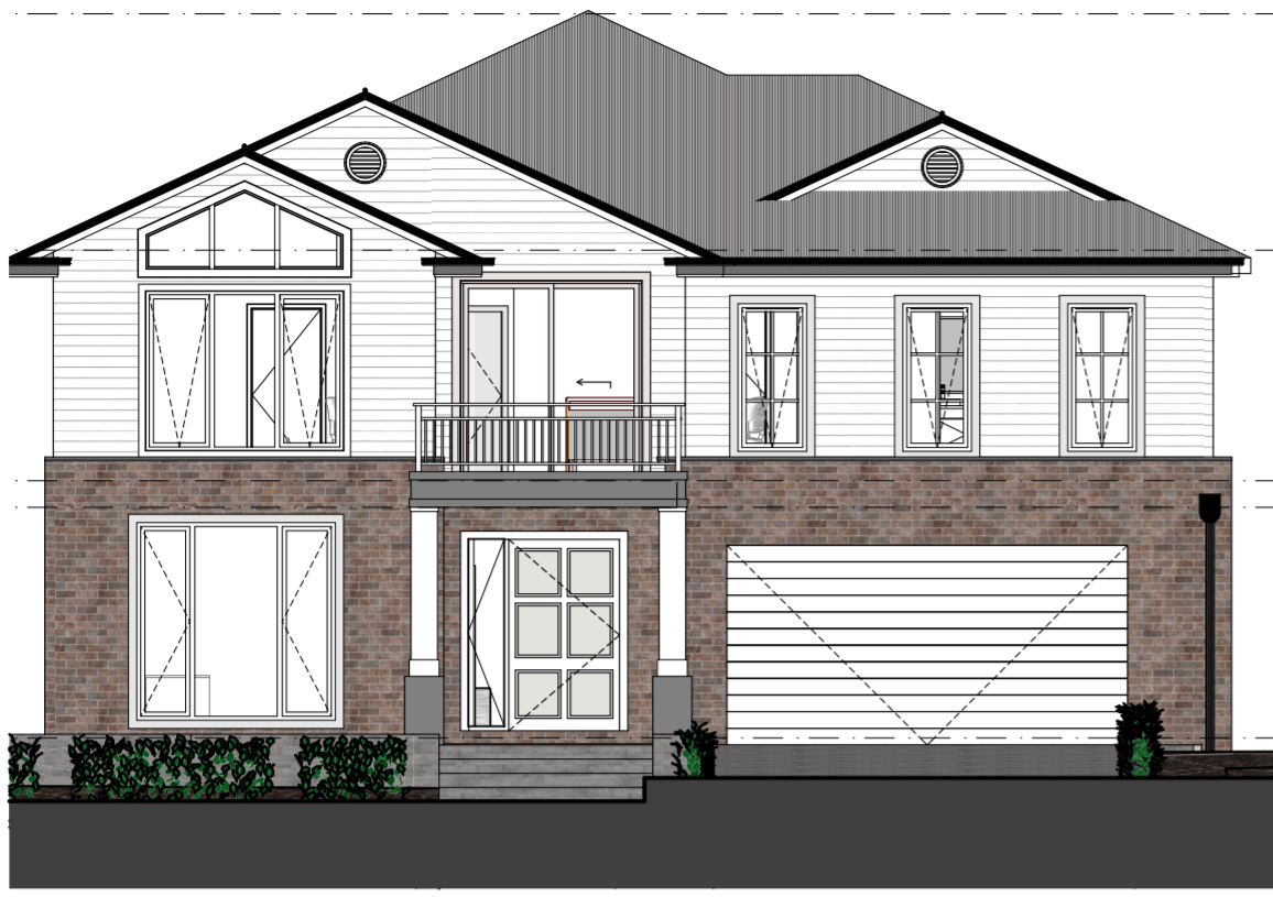
○ FRONT ELEVATION 1:100