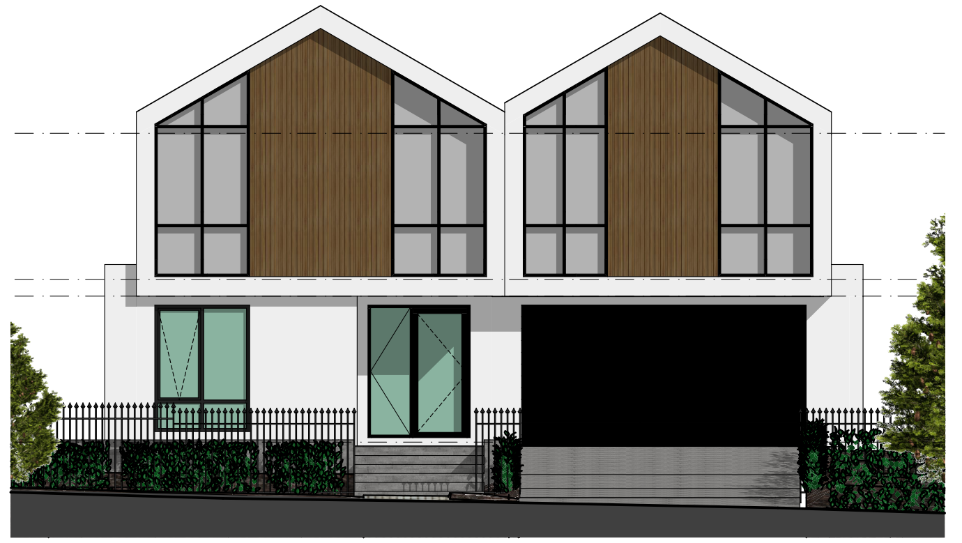
○ FRONT ELEVATION 1:100