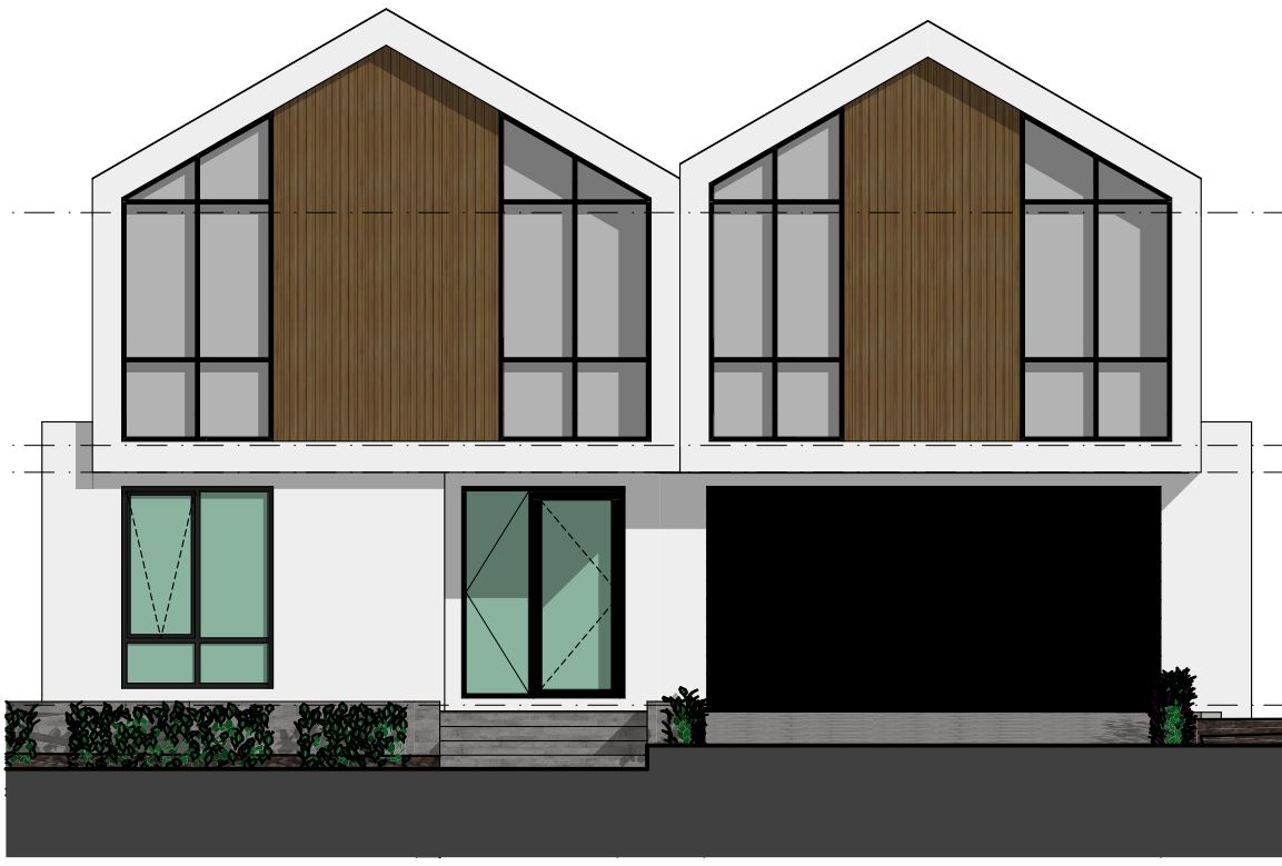
○ FRONT ELEVATION 1:100